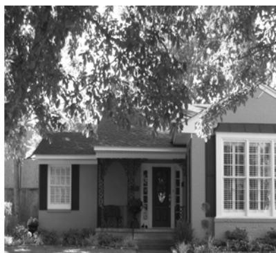
1323 North Fredonia Street

The Sterne Hoya House Museum and Library was built by prominent Texas revolutionary leader Adolphus Sterne in 1830 and is the oldest building in Nacogdoches. In 1869 the von der Hoya family bought the house from the Sternes and owned the property until 1958 when it was given to the city. For the next 20 years the house served as the Nacogdoches Public Library until the early 1980's when it was restored and reopened as a house museum. For the holiday season, the house is decorated as it would have appeared during a Hoya family Christmas. There will be information on Victorian dress, recipes, decorations, gift giving, and other holiday traditions.