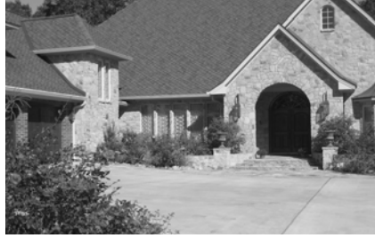
333 Deerfield Drive