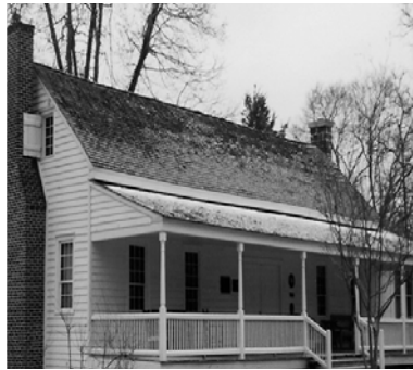
Sterne-Hoya House Museum

Celebrating it's 150th Anniversary , the Old Nacogdoches University Building is a Nacogdoches Landmark, a Texas State Historic Landmark, and is listed in the National Register of Historic Places. Opened in 1859, The Old University Building is the oldest college or university building in the state. Today the lower level is a community gathering place and the upper level houses a museum dedicated to education, a Civil War Hospital, and community events. Stop by during The Christmas Tour of Homes for a cup of Wassail, a visit with the Hostesses dressed in period costumes, and a tour of this historic public event facility and museum. Handicap assessable .