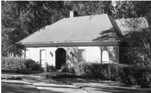
4207 Mystic Lane

Of special interest is the over-mantle above the kitchen range which features a reproduction of a French frieze of cherubs, in addition to an antique French chandelier over the island. Special paint finishes in the kitchen compliment the detailed moldings and pilasters which conceal appliances. During the holiday season, numerous themed decorated trees are placed throughout the home as well as special Christmas collectibles.