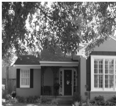
1323 North Fredonia Street

The Sterne Hoya House Museum and Library was built by prominent Texas revolutionary leader Adolphus Sterne in 1830 and is the oldest building in Nacogdoches. In 1869 the von der Hoya family bought the house from the Sternes and owned the property until 1958 when it was given to the city. For the next 20 years the house served as the Nacogdoches Public Library until the early 1980's when it was restored and reopened as a house museum. For the holiday season, the house is decorated as it would have appeared during a Hoya family Christmas. There will be information on Victorian dress, recipes, decorations, gift giving, and other holiday traditions.