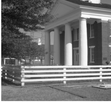
The Old University Building